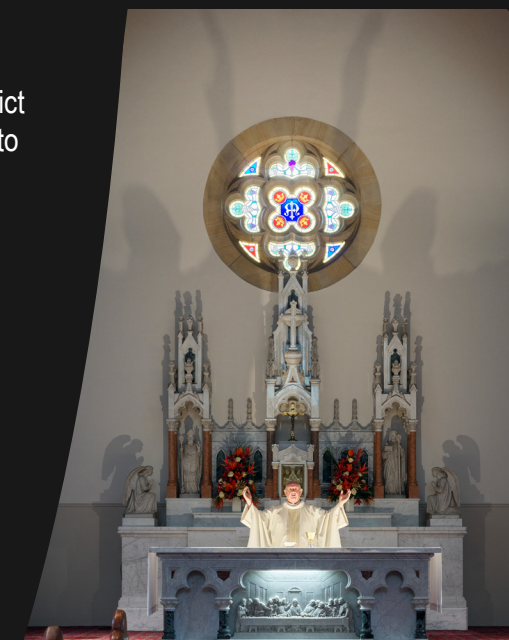
Shadows convey messages