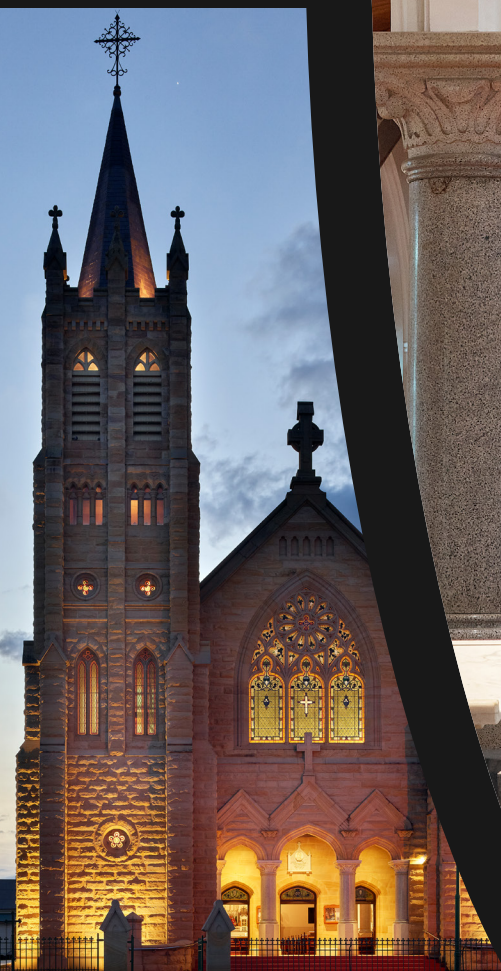
On show after 95 years