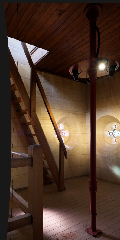
A shoring pole