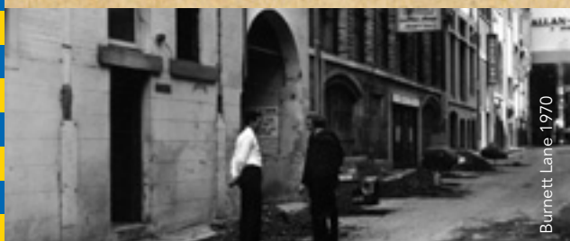
Burnett Lane 1970